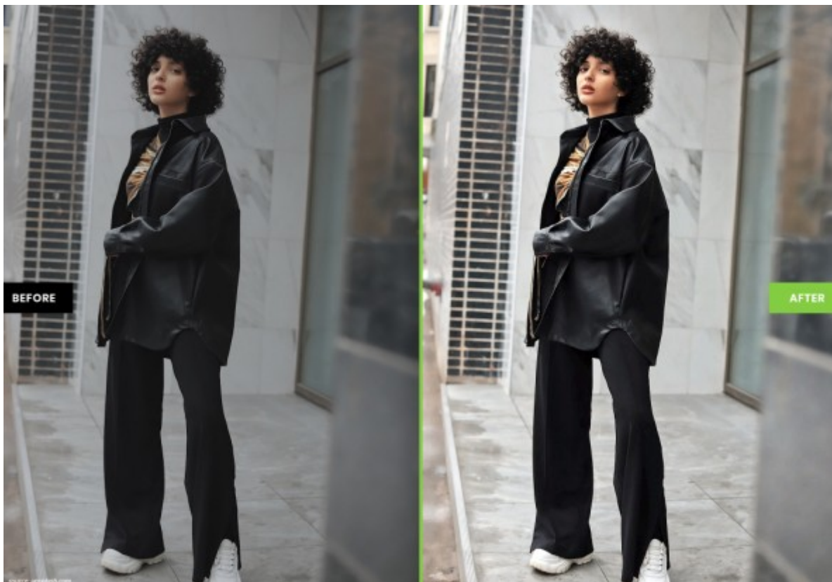
Image post-processing is an important step in image quality, and today it's easier than ever to incorporate AI image post-processing within your existing workflow.

With the prevalence of technology in our everyday lives and the proliferation of images, from personal to professional, we have come to expect a much higher quality standard from our images and this is now being made possible with AI image enhancement and optimization.